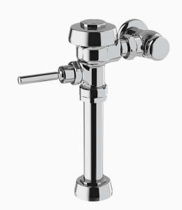
Variation Not Shown: 1.25" Flush Connection