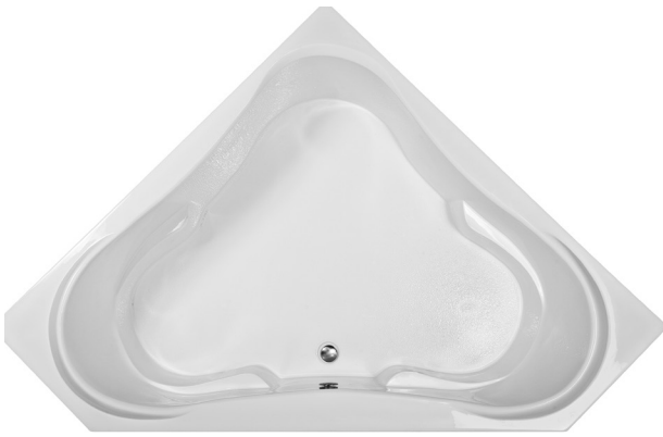
Shown with optional textured bottom.