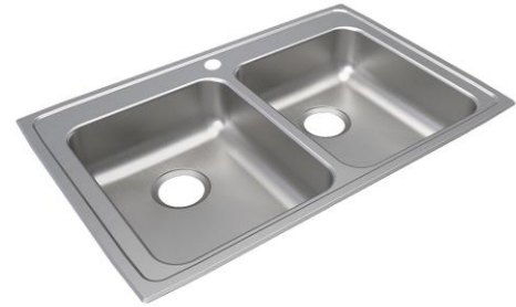
Shown with one-hole configuration. Other configurations available.