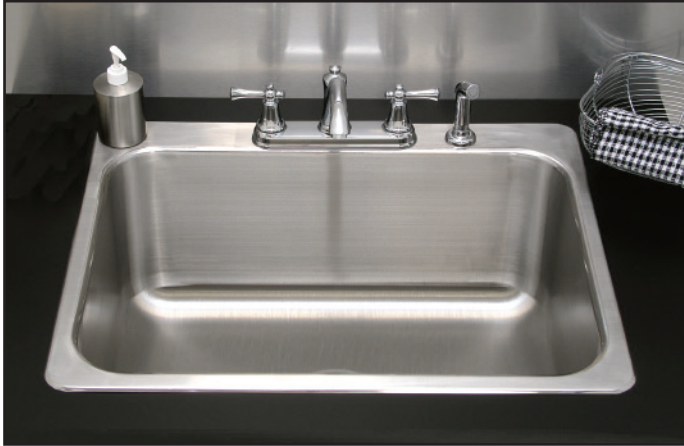
*Shown With Faucet Hole Revision K-472